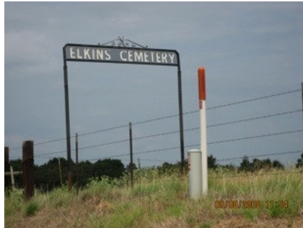
Main Entrance Sign